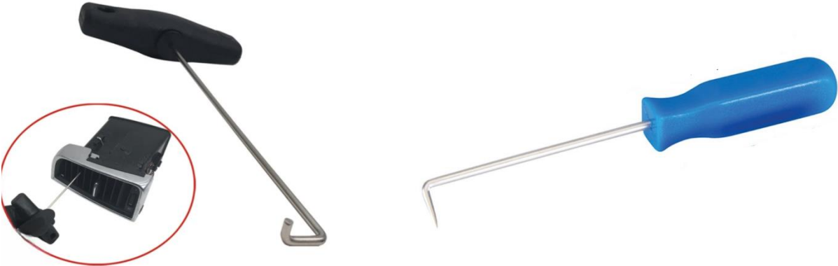
Figure 1: Special Release Hooks, Figure 2: Simple Hooks

The air vents are clicked into place at 4 points each. Clips A and B are the actual release clips. These can be removed with special hooks (see Figure 1). The same operation may also be performed with two simple hooks (see Figure 2).